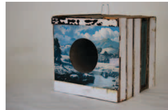
Meagan Wyke, Monument 2010 mixed media, collection of the artist