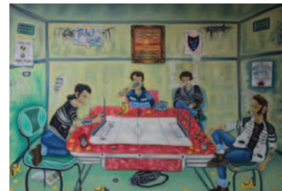
Phil Harris, Sharpies Practising Carpetby 2006 oil on canvas, City of Darebin art collection